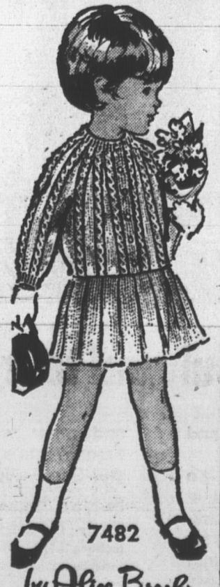
7482 by Alice Brooks

F-a-a fashion! See the diagram, see how swiftly you can stitch up, then step into this princess daytimer. Choose an easy-care cotton. Printed Pattern 4700: Women's Sizes 34, 36, 38, 40, 42, 44, 46, 48. Size 36 takes 4 1/2 yards 30-inch fabric.