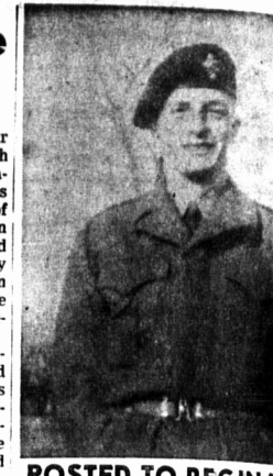
POSTED TO REGINA