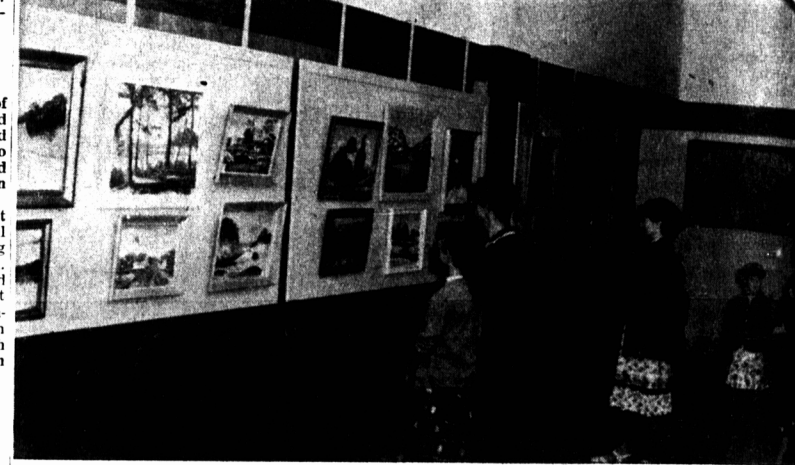
ART SHOWING AT CIVIC CENTRE

SEEKS REMEDY The low standard of living in our lying villages is a major problem in Iraq.