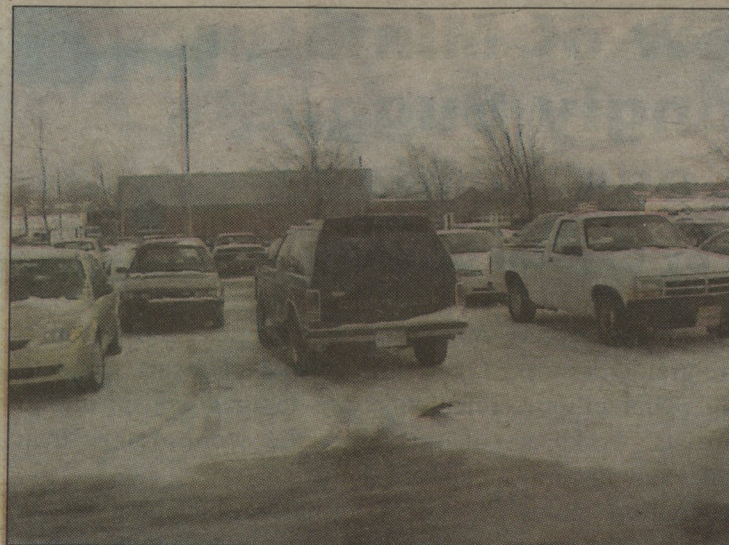
Just because you have a stupid piece of shit truck, it doesn't mean that you have the right to take up to parking spots, goddammit!