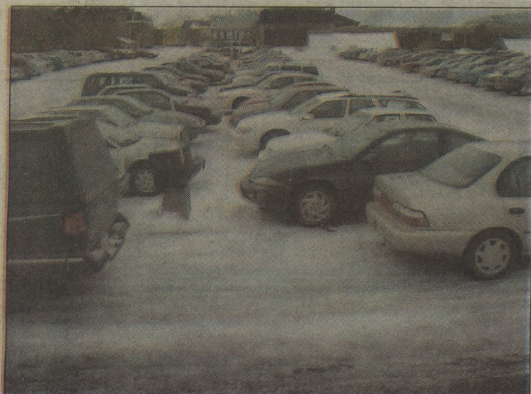
If you're going to block a roadway to invent your own parking space, at least try to park in a straight line, you idiots.