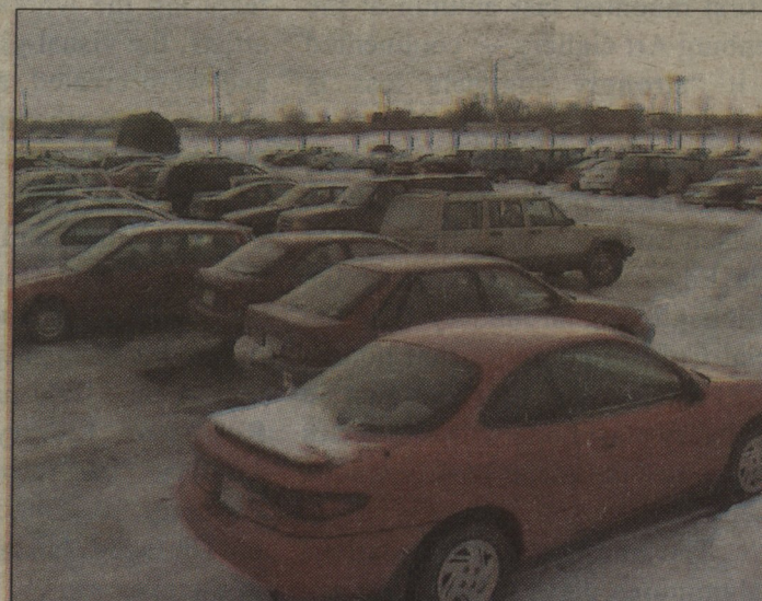
If you're going to block a roadway to invent your own parking space, at least try to park in a straight line, you idiots.