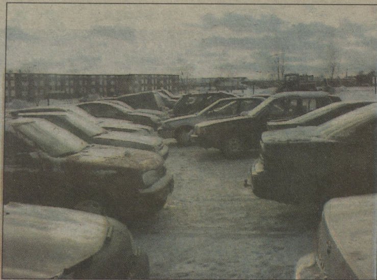
Somewhere under the snow, you stupid idiots, there's a yellow line. Use your freaking brains and imagine where it is.