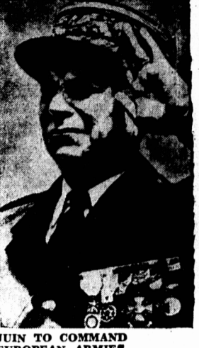
JUIN TO COMMAND EUROPEAN ARMIES One of France's foremost warriors, Gen. Alphonse Juin, has been chosen by Gen. Dwight D. Eisenhower as commander of land forces of the Allied Armies of Europe. Formerly stationed in Morocco, where he had been Resident-General, Juin will now reside in Paris.

be my luck can last forever," he thought. "I stumble onto just the guy I want, when I wouldn't have had much chance if I'd set out to find him." It was a moment before the true significance of the discovery came to him. In the excitement of the battle he had forgotten the primary purpose of his presence. Then he lifted Batson's head, shook him roughly. The wounded man's eyes opened, looked at Terry glassily. "Where's the girl?" Terry demanded.