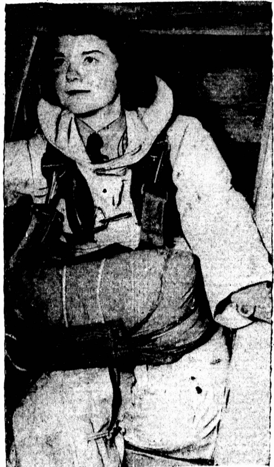
"FLORENCE NIGHTINGALES" HAVE TAKEN TO AIR

"After almost fifteen years of life in the slums I am convinced that two things are responsible for all the sin and shame which reign there—liquor and social diseases. Liquor is one of Japan's deadliest foes and is certainly the most costly sin there, as it is in the whole world today. It reduces men to animals without will, morality, or the ability to think clearly. A man who drinks, automatically divorces himself from life and from God, and makes himself a prey to poverty and all temptations."