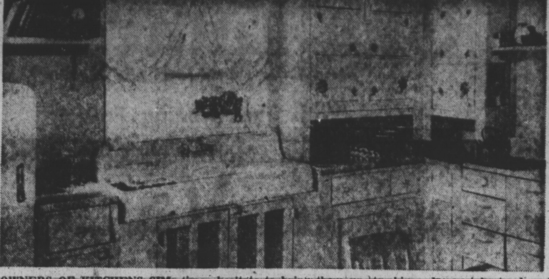
OWNERS OF KITCHENS SIMILAR TO ONE SHOWN ABOVE sometimes hesitate to bring them up-to-date because the job seems too big and may take too long to finish.