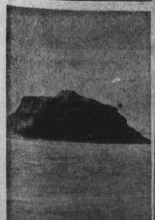
WOLFE'S ROCK IN Prince County where British General Wolfe stopped on his way to take Quebec from the French.

This time and trouble taken is gratefully acknowledged and is gratefully appreciated.