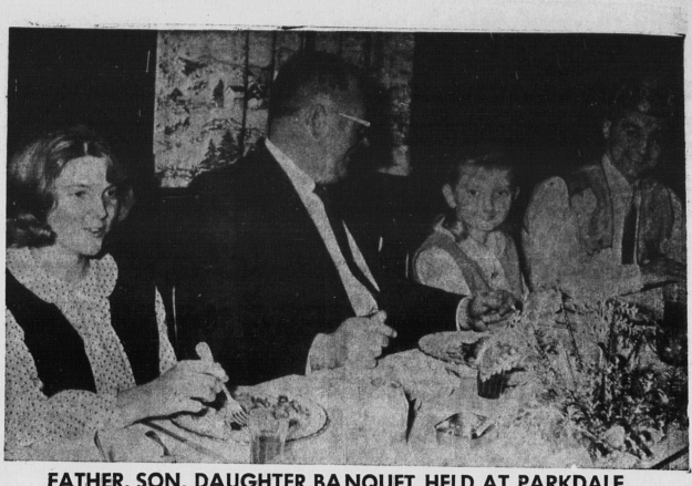
FATHER, SON, DAUGHTER BANQUET HELD AT PARKDALE