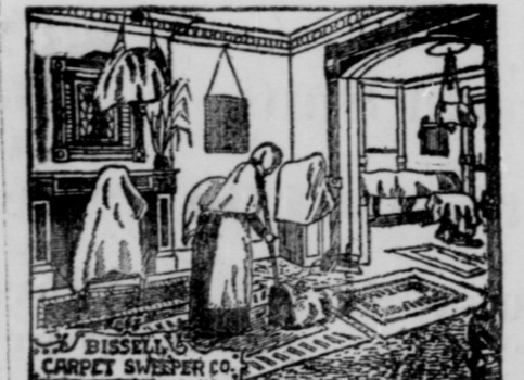
HOME AS IT WAS.

THE Gold Medal—the finest carpet sweeper that the Bissell Co. make—is used in twelve Royal Palaces and in nearly two hundred thousand homes. No dust with it, no noise, no wear on carpets, no carpet that it will not sweep and sweep it clean. Take one on trial.