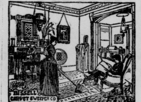
HOME AS IT IS.

THE Gold Medal—the finest carpet sweeper that the Bissell Co. make—is used in twelve Royal Palaces and in nearly two hundred thousand homes. No dust with it, no noise, no wear on carpets, no carpet that it will not sweep and sweep it clean. Take one on trial.