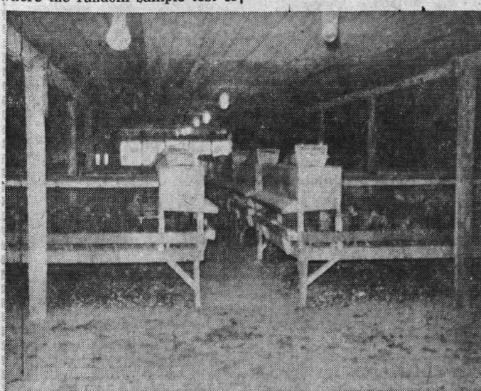
LOWER LEFT, One of the laying cages is shown with the feed trough, closest to the floor, and the eggs visible in the egg receptacle of the community nests. The nest floor is sloped just enough