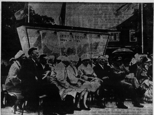
Official Opening Of Memorial Fountain In Summerside