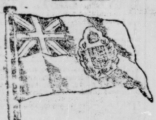
"God Save our Gracious Queen. Long Live our noble Queen." "God Save the Queen."

There will also be an excursion to Picton in the steamer St. Lawrence, and another to Summerside in the Esplanade. There will also be the usual one fare rates on the Island railway.