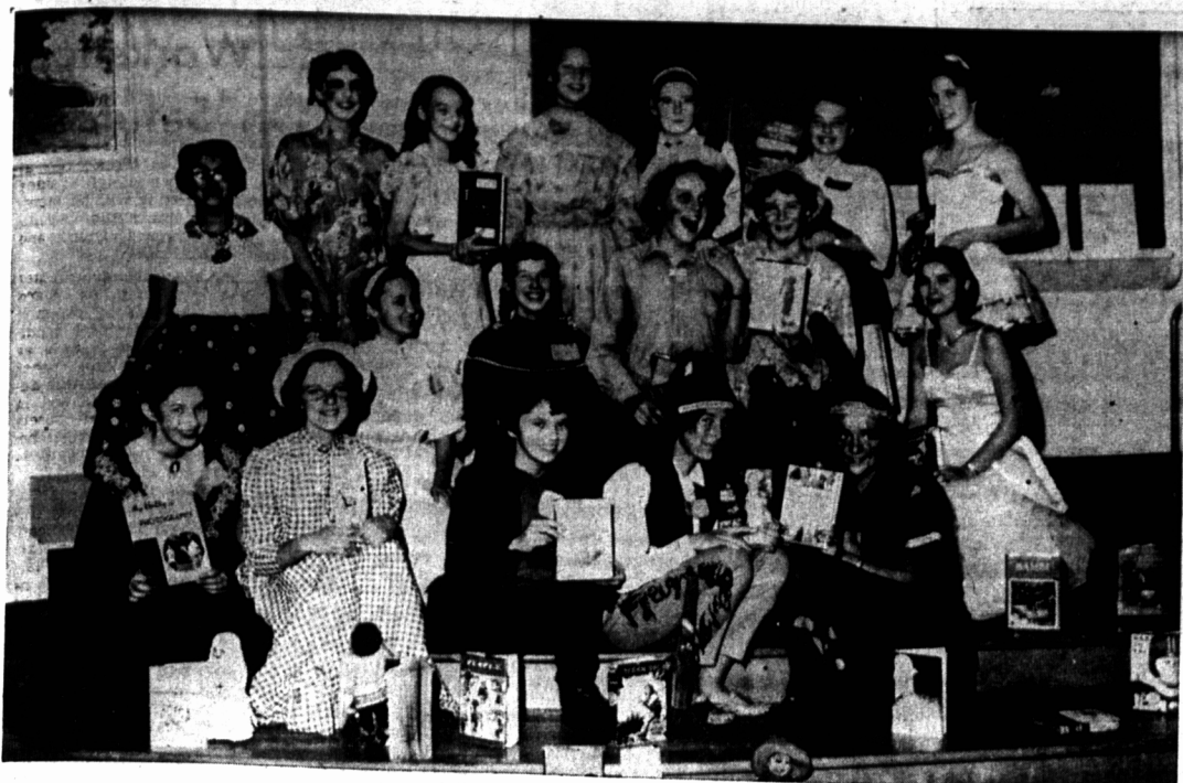
BOOK WEEK AT QUEEN CHARLOTTE HIGH