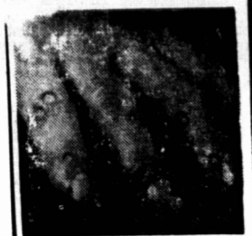
These fingers are now free from warts, after using

The fierce King Cobra of the Orient is a poisonous reptile that feeds entirely on other snakes.