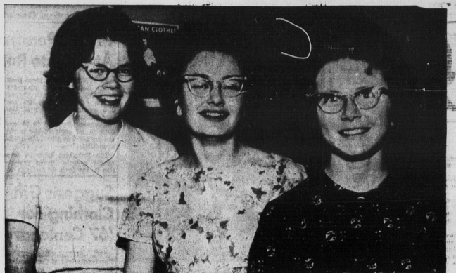
SHERWOOD JHS TRIO WINS SPELLING CONTEST