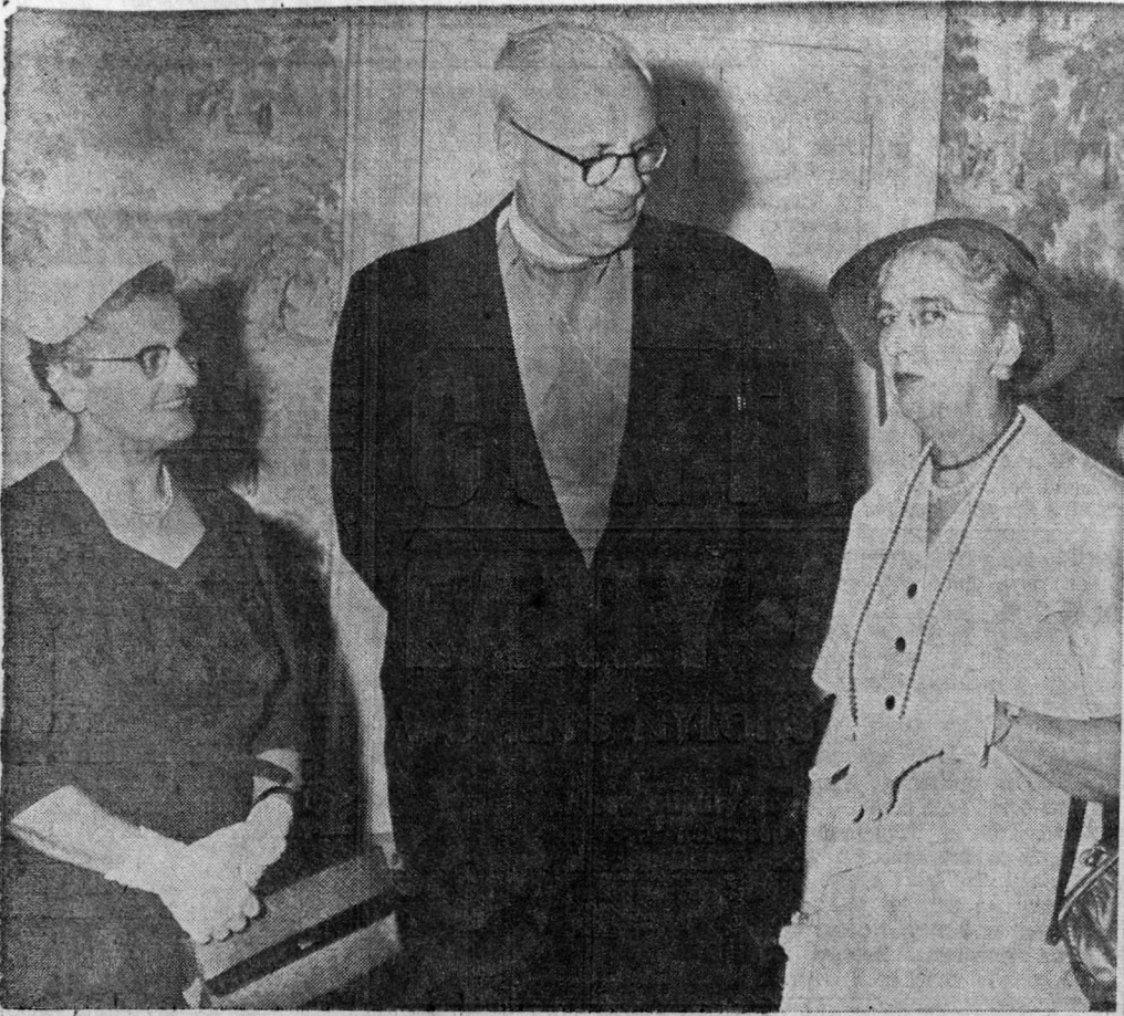
AT GOVERNMENT House Tea for Clergy and Diocesan Synod Delegates. The Lord Bishop of Nova Scotia chats with