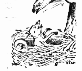
Such fierce eyes as those two great birds had.

Reddy Fox is not a climber, but his cousin, Gray Fox, is. The venturesome young Fox was a son of Gray Fox, and he had already gained to climb. This time he was