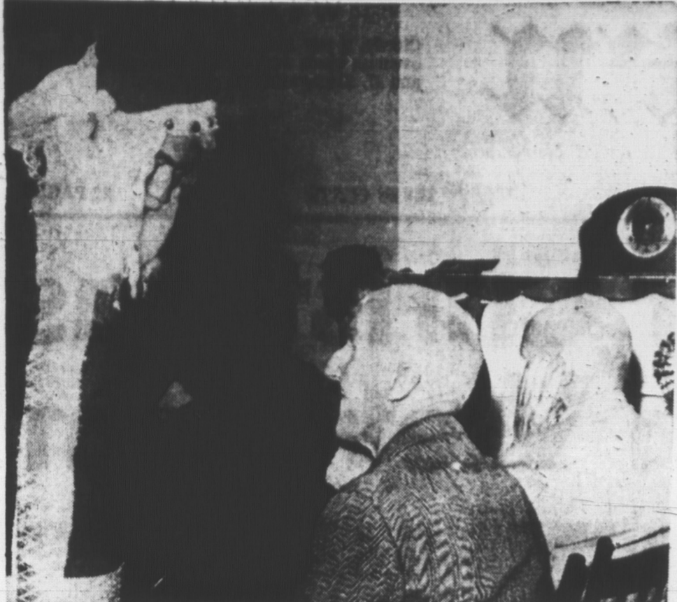
ELDERLY CITIZENS VISITED

START BIG TREK PRETORIA, South Africa (Reuters) — Transvaal farmers have begun a massive cattle drive to save as much as possible of the herds from a drought which in some areas has lasted five years. It is expected that more than 10,000 head of cattle will be moved by rail and road to areas where there is more water and fodder. The rough area covers the northern Cape, western Orange Free State, western, northwestern and northern Transvaal.