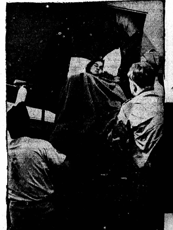
A seriously ill native woman reaches Goose Bay after a mercy flight by an R.C.A.F. crew to an Indian village. Among men are: Group Captain L. J. Birchall, St. Catharines; L.A.C. C. D. McLaughlin, Staynee; Flt.-Lieut. D. R. Cuthbertson.