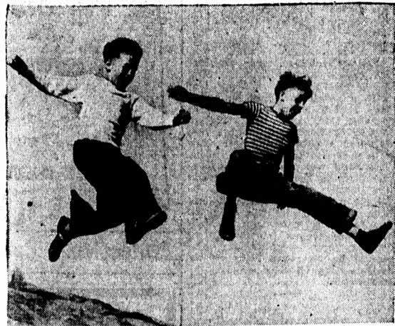
It may not seem right to trade the carefree holidays, when you were free to run and jump and shout . . .