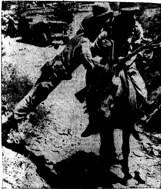
THREE ON A HORSE —When troopers of the First Cavalry Division found a horse in the Waegwan area, they abandoned their jeep for a cavalryman's first love—the horse. With two men aboard, a third man tries to mount the animal which they call "Wigwam" for his Korean home. Said one trooper: "As long as we have just one horse, we ain't just another bunch of dogfaces."