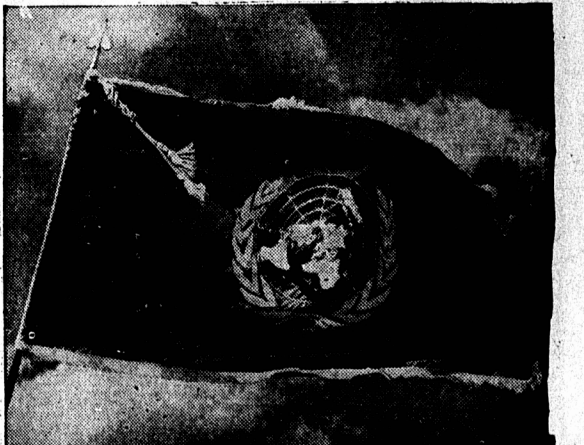
The official flag of the United Nations, now flying with national banners over the U.N. armed forces in action to restore the peace in Korea, is shown in this photograph. The background color of the flag is the light blue associated with U.N. since its early days, while the official United Nations seal in its center is in white.