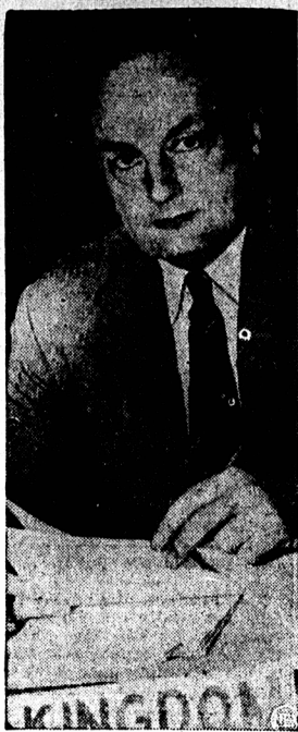
FOLLOWS MALIK — Great Britain's chief delegate to the U.N. Sir Gladwyn Jebb, is the new man in the president's chair at the Security Council, where for a month Soviet delegate Jacob Malik presided in stately fashion.