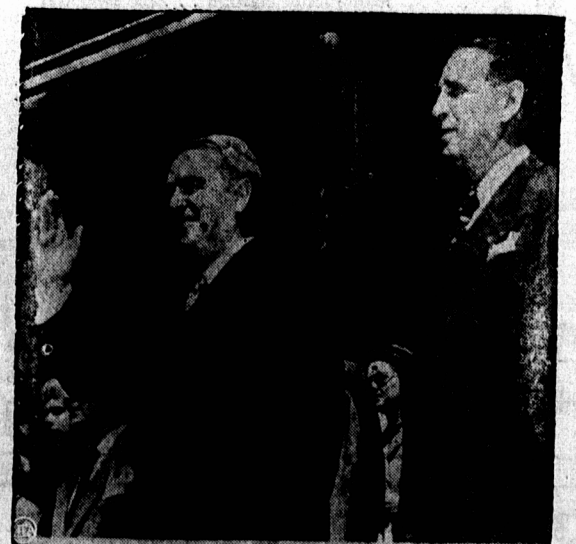
New York's Mayor William O'Dwyer observing his final day at City Hall before leaving to be the nation's Ambassador to Mexico, waves to crowds parading in his honor. City Council President Vincent Impellitteri, who temporarily succeeds O'Dwyer in office, watches at right.