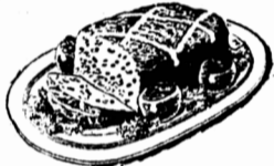
Golden meat loaf. An extra-special upper dish when you make it with evaporated milk. Tender, tasty and nutritious.