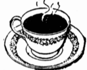
Coffee at its fragrant best! Pass a pitcher of undiluted evaporated milk, and you'll be famous for your delicious coffee.