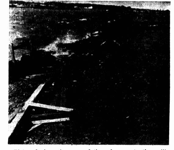
Pictured above is some of the damage to the railing at Victoria Park as a result of the pounding received during the storm of Saturday night and Sunday morning. The picture was taken at the turn of the roadway facing York Point.