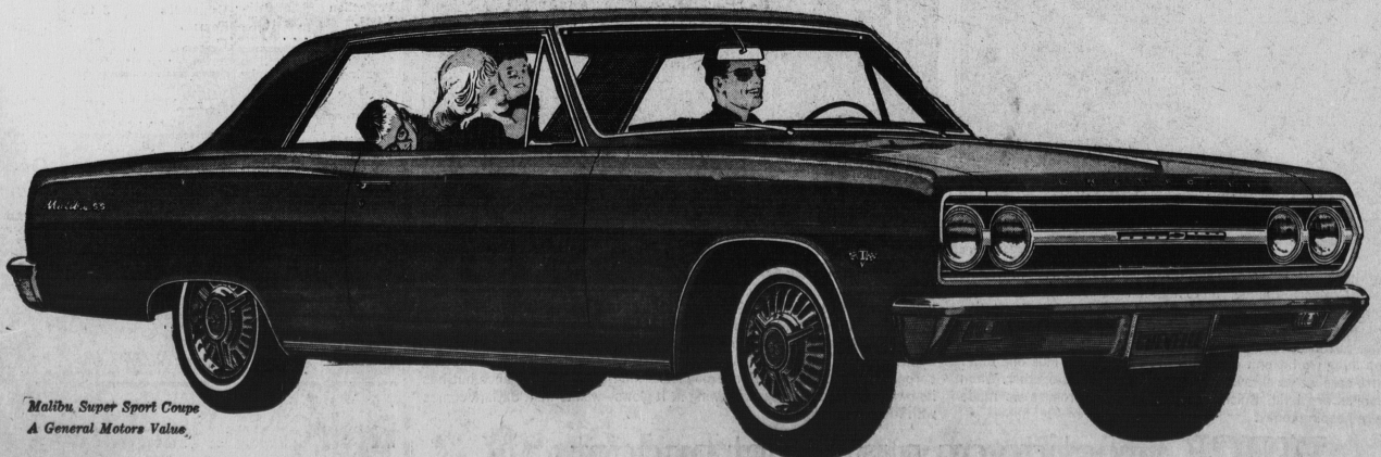
Malibu Super Sport Coupe A General Motors Value

New style, new ride—and plenty of V8 stuff. Here are all the things that have made Chevelle Canada's popular new-sized car—plus some new surprises! From its new V-shaped grille on back, Chevelle is beautifully proportioned between the regular Chevrolet and Chevy II. You'll enjoy the silky way it skims over the choppiest roads, thanks to softer coil springs and other suspension system refinements.