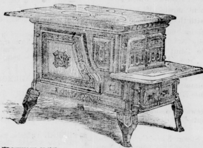
WELLS & CO. ST. JOHN