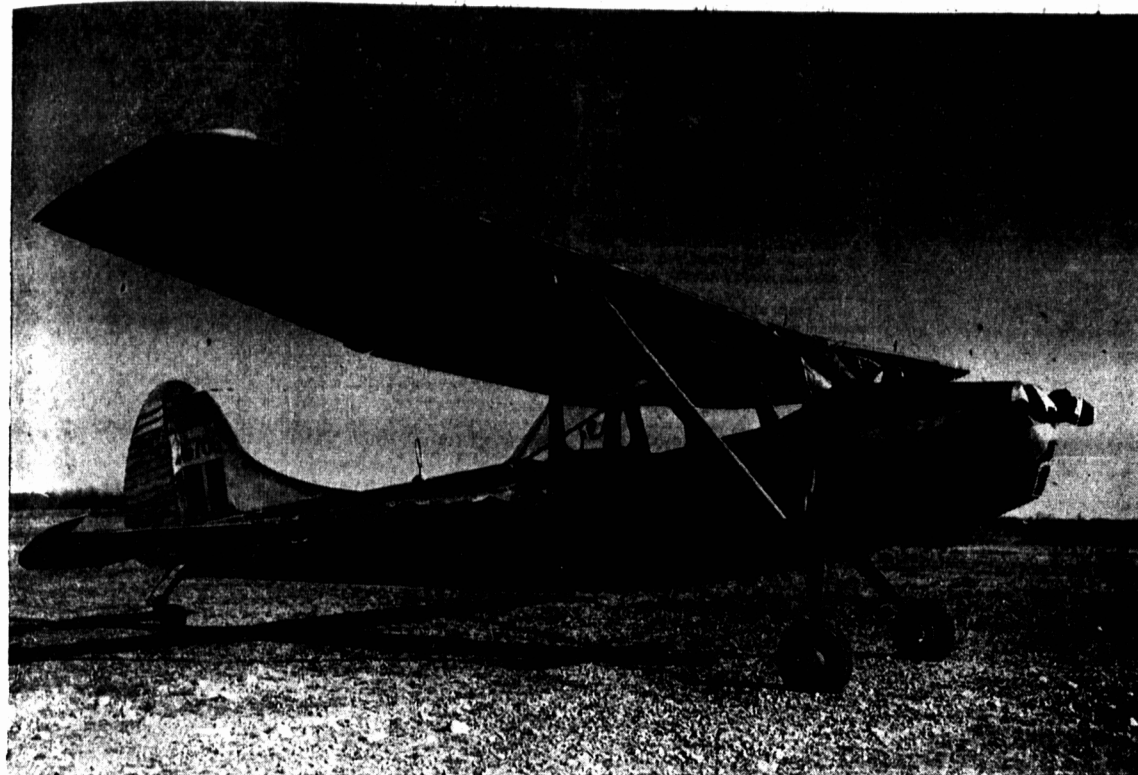
Sixteen of these American Cessna L-19 light planes have been bought by the Canadian Army as artillery-spotter planes. With the increasing emphasis on mobility in the army it is possible the soldiery will get more planes to supplement trucks in the movement of personnel and equipment from railroad to corps. The new planes are being serviced by the RCAF at Trenton, Ont., before being handed over to the army.