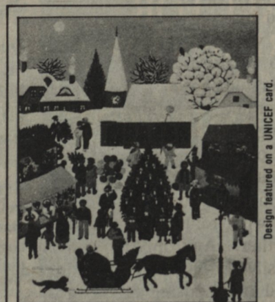
Design featured on a UNICEF card.

"Up yours, I'm not cranky you morons!..."