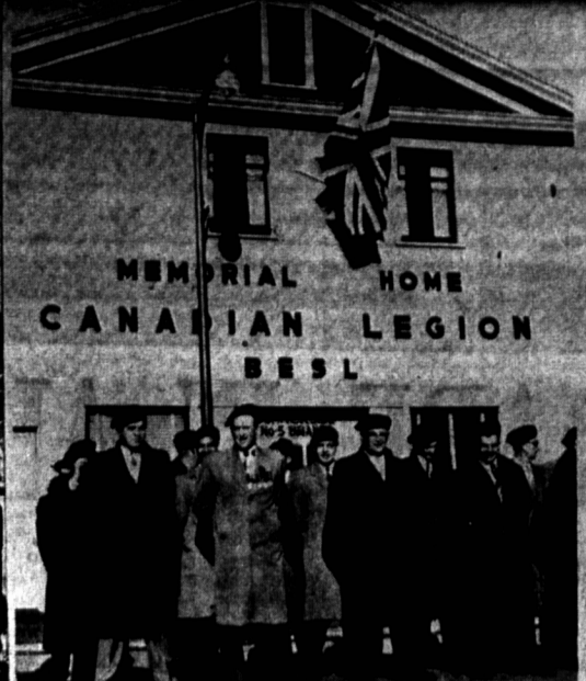
S'SIDE PARADE FORMED HERE