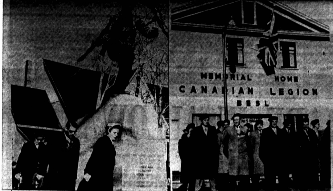
LAYING WREATHS AT S'SIDE CENOTAPH