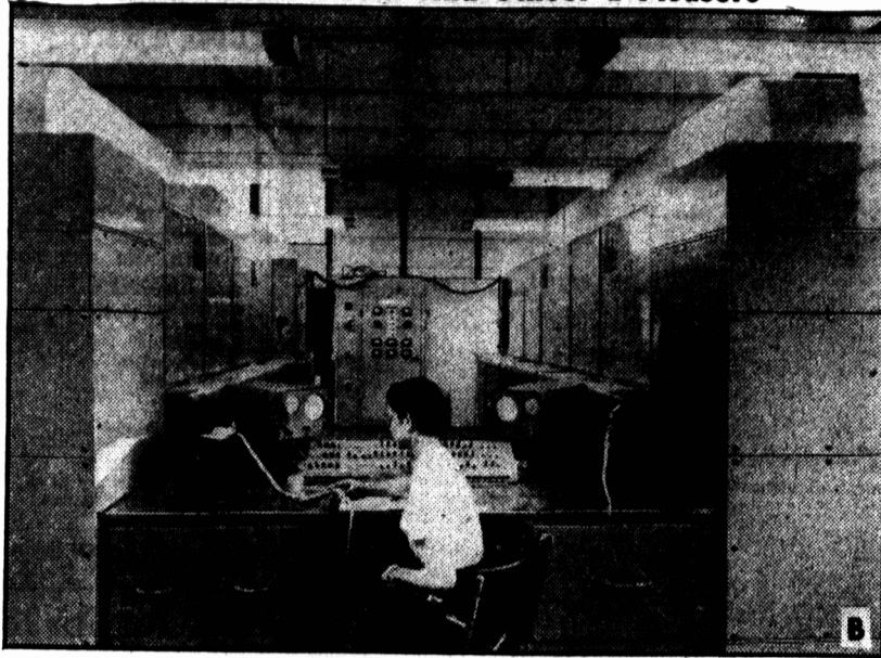
CHILDREN struggling with sums would find life much easier if schools could be equipped with this electronic brain, but unfortunately for them it is to be installed in a British aircraft plant where it will lighten the burden of designers and technicians. Mathematical problems it will automatically tackle will deal with such matters as vibration, wings and stability.