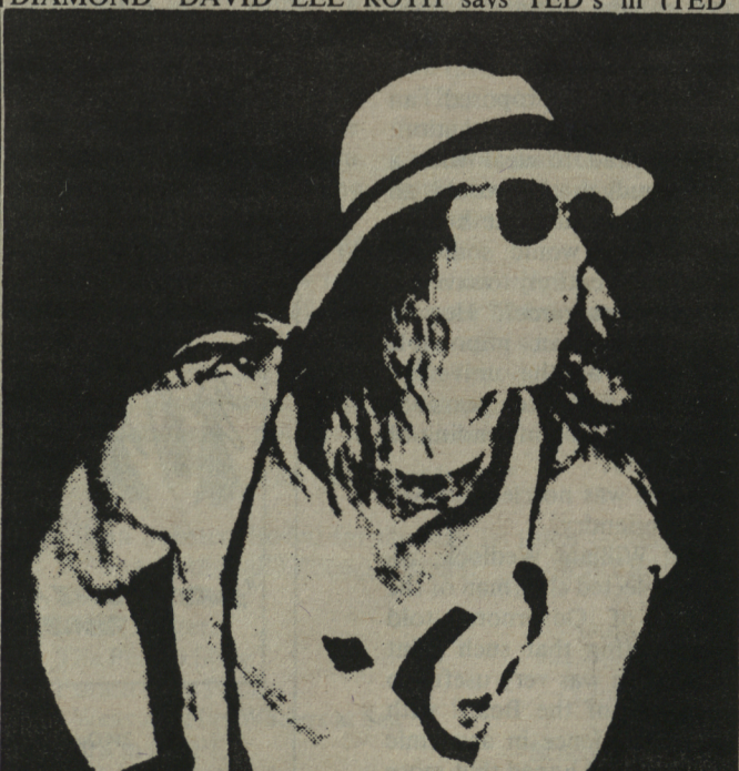
Disputes in the Van Halen camp?