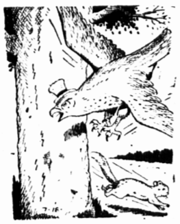
He was near enough to the ground to leap down and did as Redtail had just said.

hoping that Happy Jack would come down on the ground where he could be caught. Happy Jack had no intention of going down on the ground if he could help himself. But could he help himself? You see, great as was the danger below there was even greater danger above.