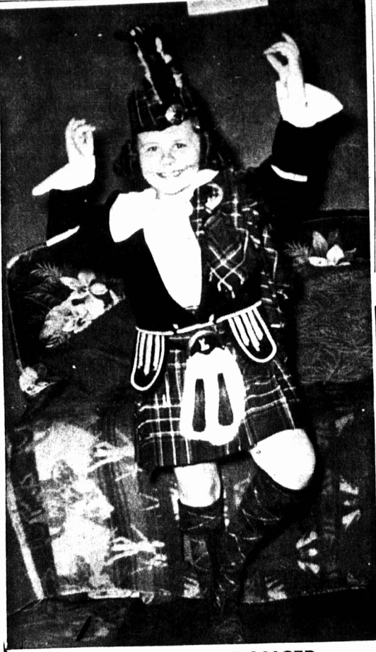
WEE BONNIE DANCER