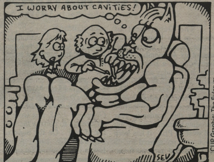
CUP Graphic: The Fulcrum