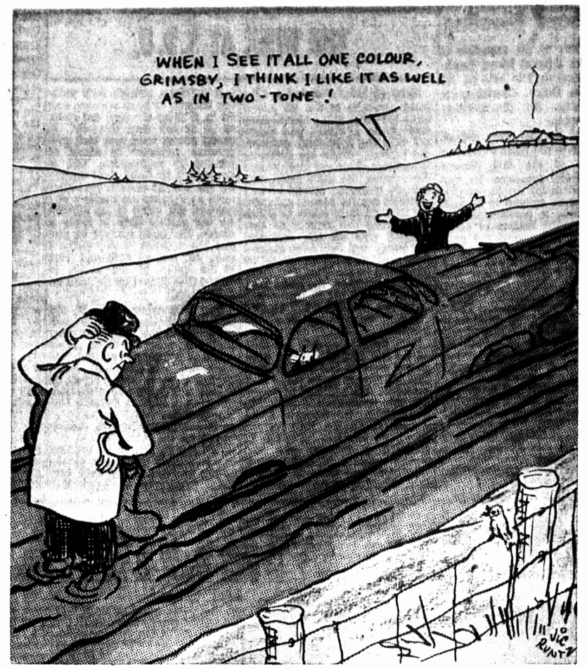
LOOKING AT IT FROM A DIFFERENT ANGLE

Former President Truman is sailing for Europe on May 11 for a two months visit. He will be getting back just as the Democratic nomination campaign enters its most interesting phase, and, incidentally, in time to reconsider his refusal to "run again", should that be deemed advisable by the party's strategists.