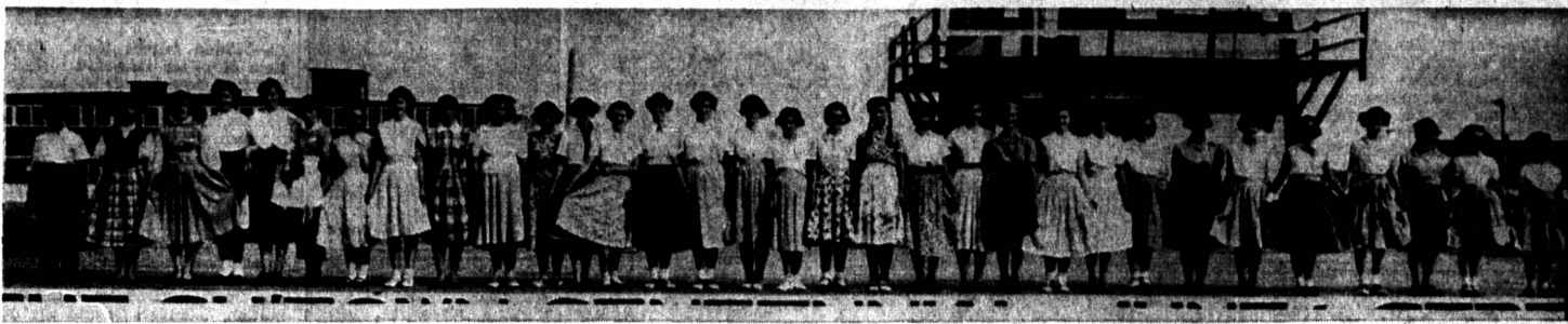
Ladies of fashion—might well be the title of this picture taken at the Rural Youth Fair Friday. It shows a group of 4-H girls displaying clothing which they had made for themselves.