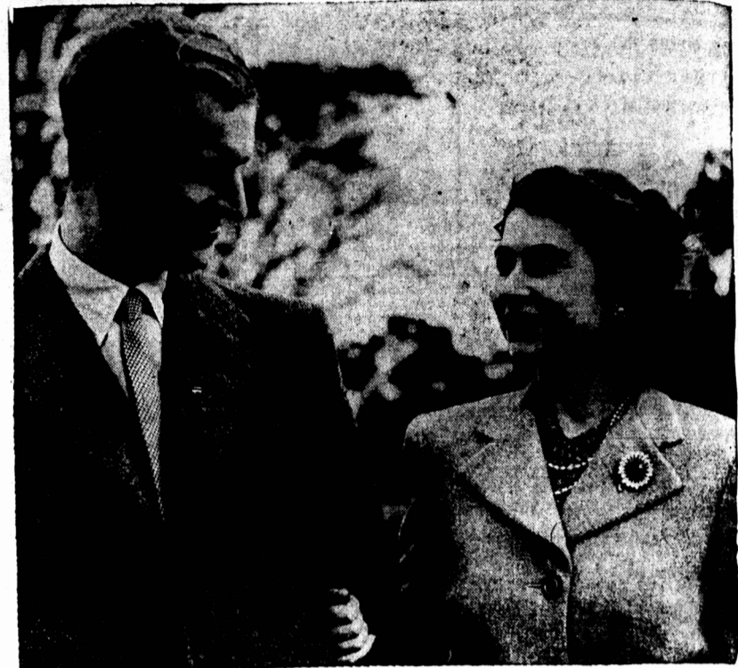
Princess Elizabeth and the Duke of Edinburgh spent their honeymoon at Broadlands, Romsey, Kent, home of the Mountbattens.

It is this innate sense of Royal duty that makes Princess Elizabeth pay such careful attention to her clothes for she is not na-