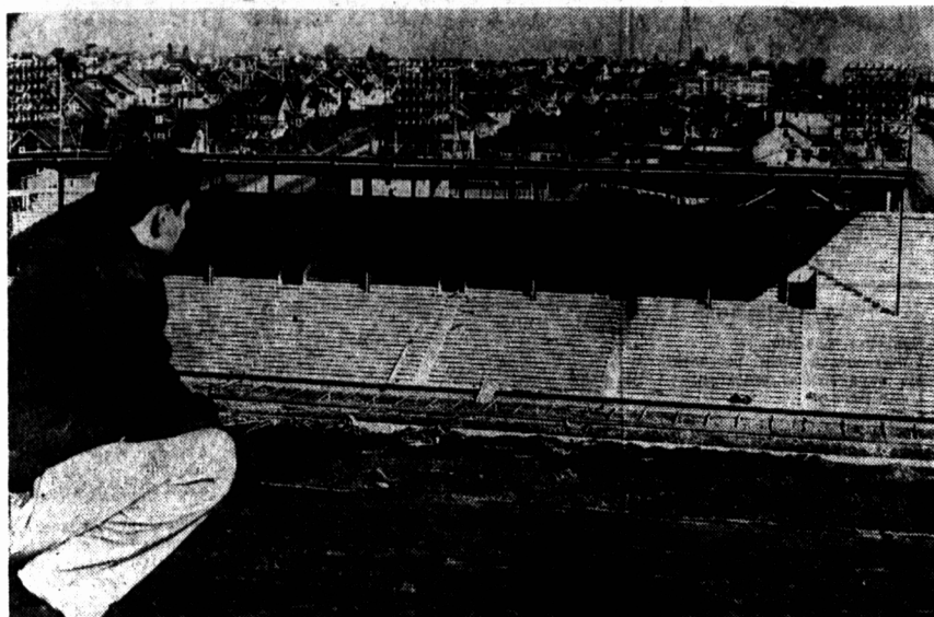
A workman surveys the new British Empire Games Stadium in Vancouver. This is an early construction shot of the $1,200,000 stadium built at Exhibition Park. After the Games it will be the home of B. C. Lions, newest entry in the Western Interprovincial Football Union, and will be known as Exhibition Bowl.