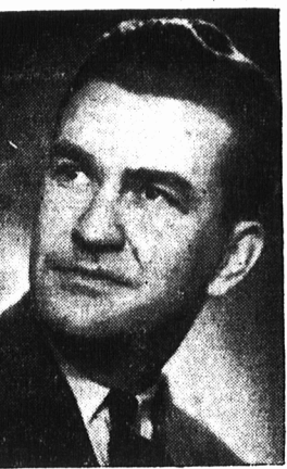
Mr. J. Angus MacLean