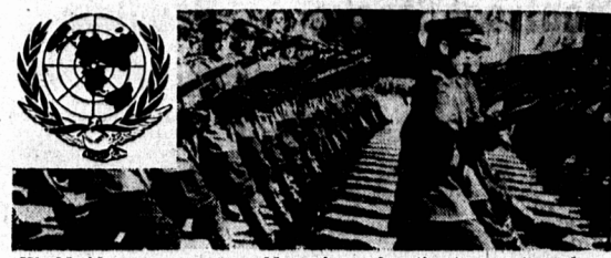
Worldwide arms census would require each nation to report number of troops, A-bombs, tanks, planes, ships and military production facilities it has. Troops above are Russians on parade in Moscow.

Arrangements were made for the presentation of life memberships to three women who have been