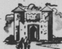
You'll visit fabulous Disneyland!

2 GLORIOUS WEEKS with all expenses paid!