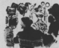
You'll see how movies are made!