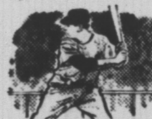
You'll see Major League Baseball!

It's the trip of a life time for Mom, Dad and all the youngsters! Two weeks in Southern California with all transportation and living expenses paid for by Kellogg's, including $500 spending money for clothes and incidentals. All you do is give the Kellogg Corn Flakes Rooster a name. It's easy. How about "Big Red"? or "King of the Roost"? But you can do better than that! The more names you enter, the more likely you are to win. Either the Grand Prize California Vacation—or one of the five weekly contests in which 50 CCM Rambler Bicycles (or tricycles) or Westinghouse Transistor Radios are awarded each week. Read the rules below and start writing down your name now!