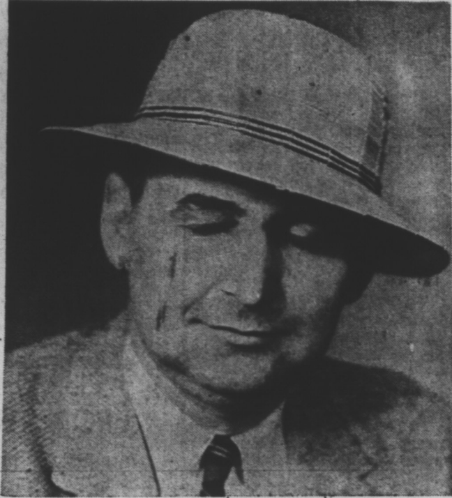
THE WHITE HUNTER