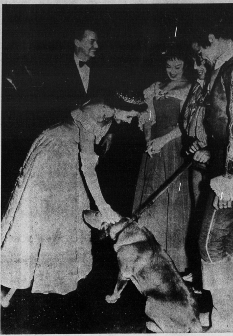
AN "ACTOR" in an excerpt from a Shakespearean play gets a pat of approval from Queen Elizabeth at London's famous theatre—the Old Vic.

Combining as she does the great responsibilities of her official position with the care of a young family and a great love