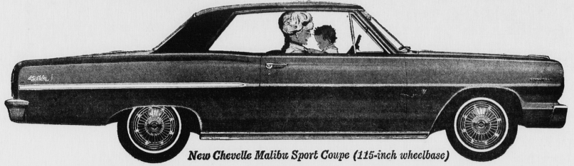
New Chevelle Malibu Sport Coupe (115-inch wheelbase)