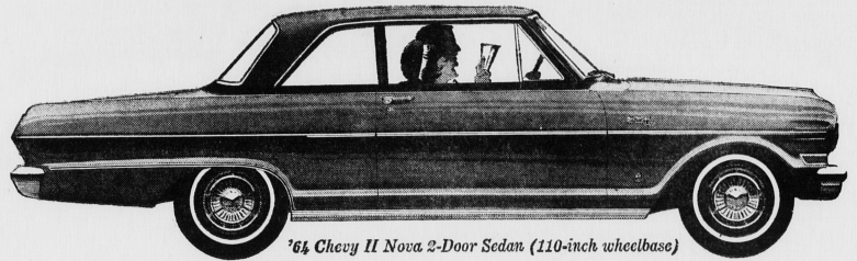
'64 Chevy II Nova 2-Door Sedan (110-inch wheelbase)