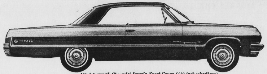
'64 Jet-smooth Chevrolet Impala Sport Coupe (119-inch wheelbase)