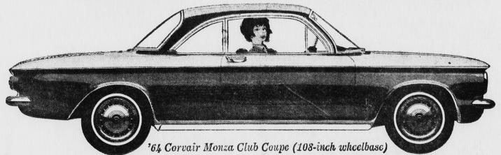
'64 Corvair Monza Club Coupe (108-inch wheelbase)