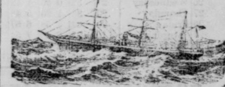
THE steamship "CLIFTON," is intended to leave