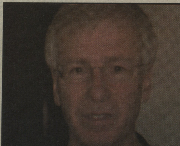
"Snobbish people." Stéphane Dion - Federal Minister of Environment