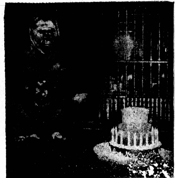
"APE-Y BIRTHDAY TO YOU . . ."—Bushman, the famous gorilla at Chicago's Lincoln Park Zoo, wasn't too much impressed with his 22nd birthday cake. Bushman was honored by the Chicago Press Photographers Association, which called him "the most photographed animal of all time."