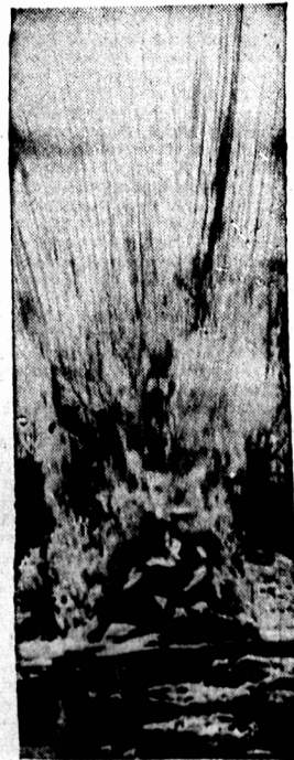
Men are dynamiting mouth of Etobicoke creek to clear channel of tightly-packed ice floes which backed up the water and spilled it into the streets. Here ice and spray are sent high into air by blast.