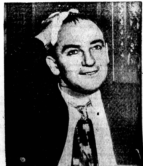
THINGS ARE GETTING HOT—Red-hunting Sen. Joseph McCarthy of Wisconsin, seems to be feeling the heat during the controversy over alleged Communists in the State Department. President Truman's blast that McCarthy is "the Kremlin's greatest asset in this country" didn't cool things.