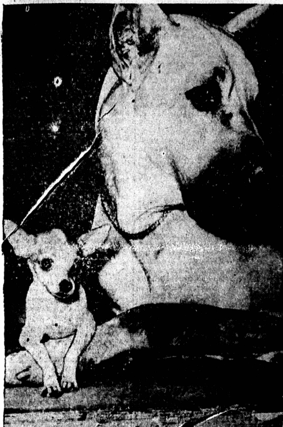
If Canadian Kennel club has its way, nose-printing will officially be added to methods of identifying dogs. The method will be used, it is hoped, to identify purebreds. It is thought that this method will prove more foolproof than tattooing. El Zorro, two-pound Chihuahua, rests on paw of 150-pound Great Dane.