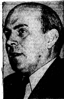
JOHN J. McCLOY John J. McCloy, U.S. high commissioner for Germany, recently sounded the call to Western Europe to accept Western Germany as a full partner in the campaign to stop Russia. McCloy recently returned from high level consultations in Washington. His words obviously were approved by President Truman and U. S. Secretary of State Dean Acheson. They followed other recent appeals by Britain's Winston Churchill and France's Gen. Charles de Gaulle to their own governments.