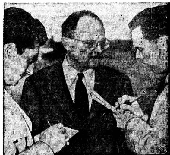
Owen Lattimore (centre), accused by Sen. Joseph McCarthy of being a "top spy", talks to reporters as he stops over in Rome, Italy. Lattimore, in Afghanistan on a United Nations mission, is heading for Washington where he will answer McCarthy's charges, which he calls "pure hokum."