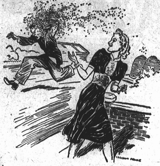
"I've got a good idea, George. I'll ring up our air raid warden." —Humorist.