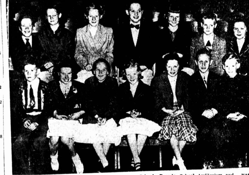
Above is shown the Albany Rural School chorus which won first place in the Grades 4-5-6 section of the 1 to 3 classroom division of the Schurman School Parade. This group performed on the special program held on the evening of May 22nd in the Summerside High School Auditorium and was presented with a beautiful silver shield emblematic of the high honor it won.