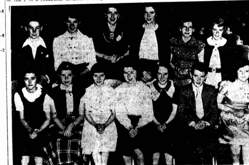
Above is the North Beedeque Schurman School Parade. This group performed on the special program held on the evening of May 22nd in the Summerside High School Auditorium and was presented with a beautiful silver shield emblematic of the high honor it won.