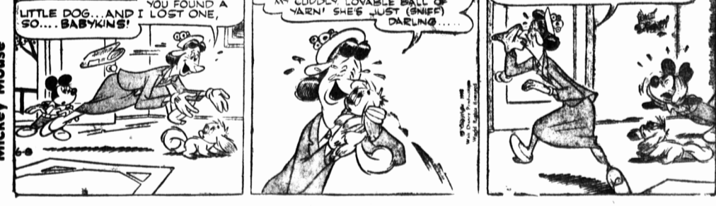
By Walt Disney