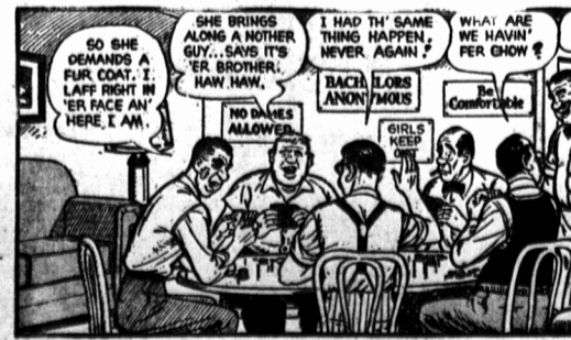
By Hom Fisher

Yesterday's Cryptquote: PATRONS OF PLEASURE, POSTING INTO PAIN!—YOUNG.