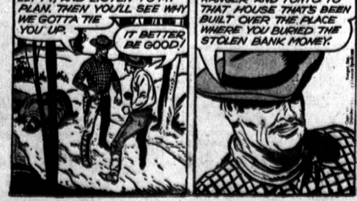
By Mel Graff