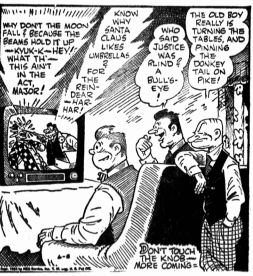
By Fran Striker Secret Agent X9