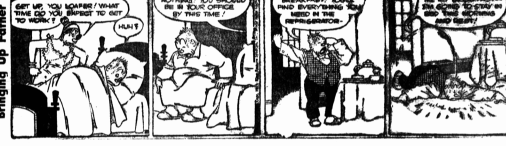
By George McManus