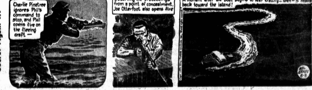
By Mel Graff