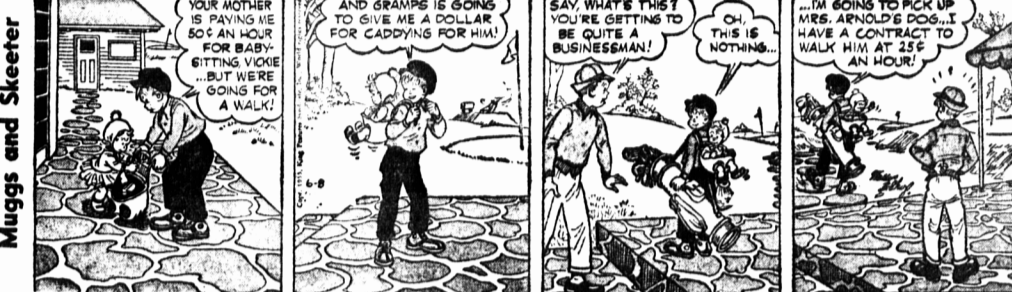
By Wally Bishop