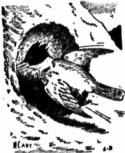
Rattles went to see for himself how things were.

A delicious treat after you eat... chewing aids digestion while the flavoured sweetens your breath!