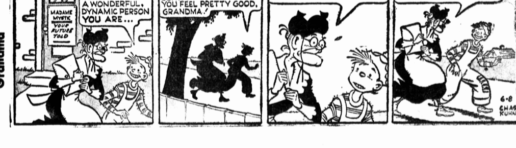
By Charles Kuhn