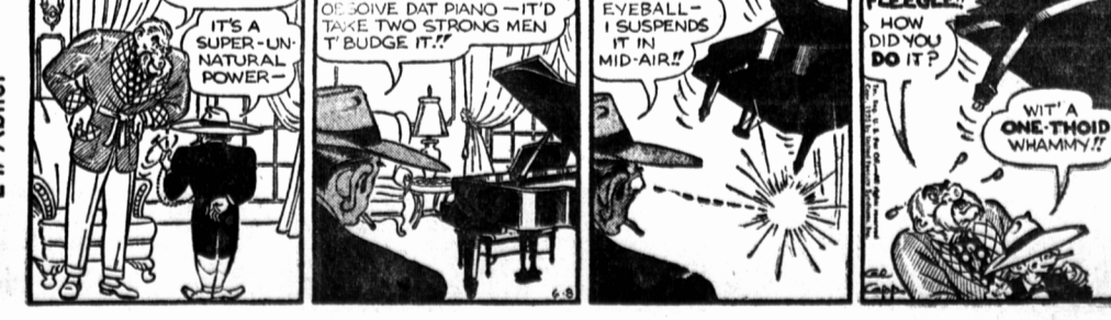
By Al Capp