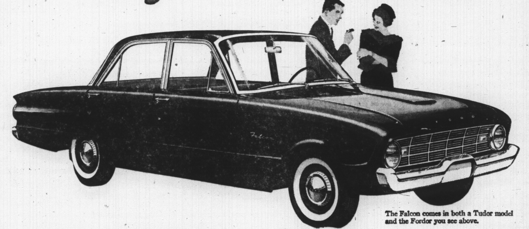
The Falcon comes in both a Tudor model and the Fordor you see above.

It's new Ford Falcon day! When you wish upon a car... and that car's a new Ford Falcon, all the practical, economical, beautiful things you wish for will come true. Lots of leg and head room, with unusual visibility. Honest comfort for six adults. Wide-opening doors, foam-cushioned front seats and 23 cubic feet of easy-loading trunk space! The Falcon's lively 90-hp Six averages just over 30 mpg, with the smooth ride and solid feel of a much larger car. Yet its handy dimensions make it a joy to handle in traffic. Squeaks and rattles have nowhere to start in the Falcon's single-unit construction. Critical areas on the underside are zinc-coated to prevent rusting. And front fenders are removable for easy replacement. Don't wish—walk in to your Ford Dealer's. The car that makes beautiful sense is here!