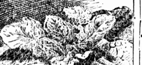
THE NEW AND IMPROVED STRAIN OF SPINACH LEAVED SPINACH HAS BECOME A FAVORITE WITH THE HOME GARDENER.