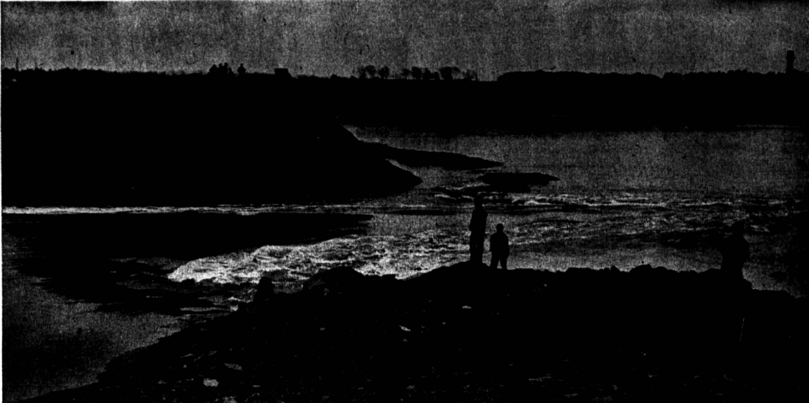
No need now to go to Saint John to see Reversing Falls. The outgoing tide boils turbulently seaward through the now narrow gap in the North River Causeway. A few hours later the falls appear on the opposite side as the returning tide rushes up river.