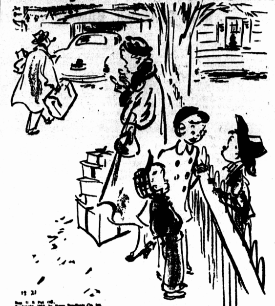
'Our grandpa has a big barn, forty cows and a new television set.'